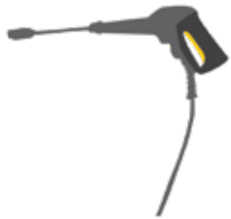
Power washer - With a 40° tip, preferably 7.5 volume