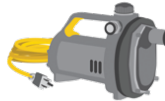
Pump - Slurry pump