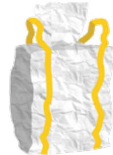
Slurry pit, slurry bag or tote - Slurry pit, Slurry bag, Available @ Universal Cement