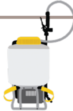
Backpack sprayer - 4 gallons to 4 1/2 gallons either pump or electric and paint screen for screening release into sprayer