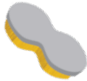
Soft bristle brushes (recommended) - Have medium and hard bristle brushes on hand for stubborn areas